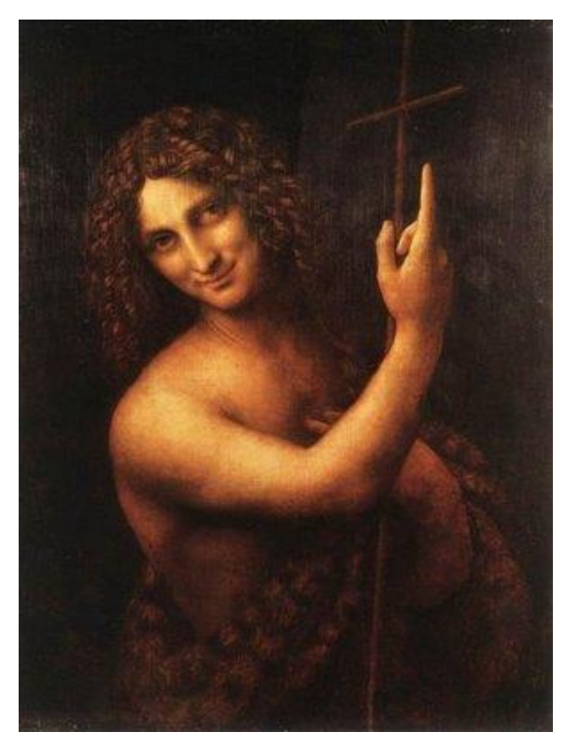
Figure 1. St. John the Baptist. Leonardo da Vinci, 1515.

Ambiguity is possible to be appreciated in his works, when he ingeniously forges a mysterious smile in his androgen characters, frequent in paintings and unfinished sketches, whose aesthetic stems from the mixture of classical themes with Christian motifs (Figure 1).